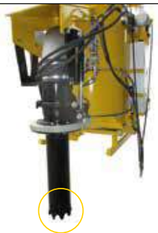
Rotating suction tube (folding) with reinforced serrated crown